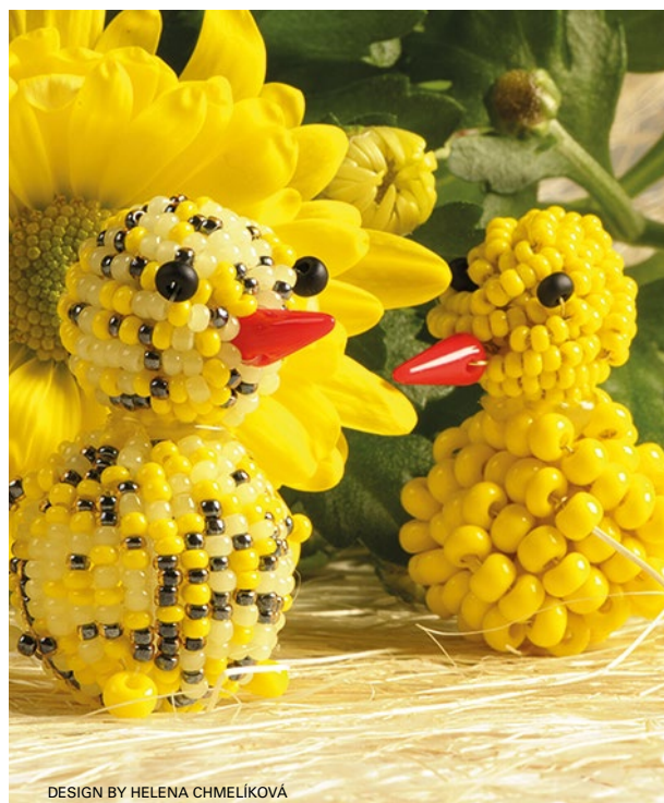
DESIGN BY HELENA CHMELÍKOVÁ