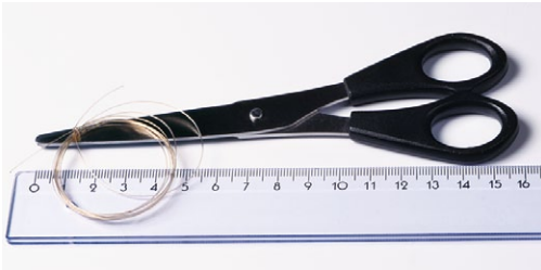
a 0.25 mm nylon line, scissors, a ruler, an 8 cm Christmas bauble

PRECIOSA rocaille (R) 331 19 001; 10/0 (R10); 7/0 (R7)