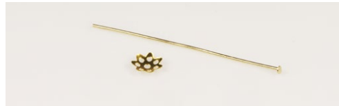
Metal parts: an eye pin, a decorative metal part

a 0.25 mm line, a 0.3 mm wire, a thin stringing needle, scissors, flat nosed pliers to flatten the end of the line, needle nose pliers