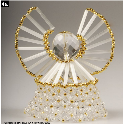
DESIGN BY IVA MASTNIKOVÁ

downwards, create only 5 windows, pull the outer FPB3 into a ring (fig. no. 4b). Attach the head to the body by attaching the bead which has been sewn round with smaller beads at the site of the angel's neck. Thread the line through the holes on one side and string the FPB3 on the other side. Tighten the stringing and complete it with a knot by the lower bead (fig. no. 4c).