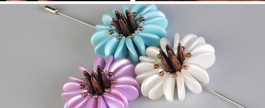
Design by Helena Chmelíková Technique: right angle weave, basic beadweaving, sewing the flower onto the perforated base plate