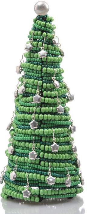
If the tree has been made using transparent rocailles, you can use it with a candle. Place a tea light under it. Put them both on a flameproof base. CAUTION! The tree will become hot with a candle beneath it.