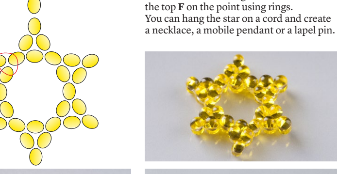
Create two stars. Hang two hooks on

after sewing up the star, you can tie off both