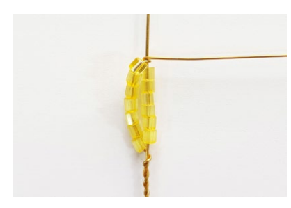
Make a counter-row on the right. String 1x yellow TR and as many yellow TC as you need to complete the row and start a new one on the working wire. Turn the work "upside down" as this makes it easier to attach the row to the main axis wire. Place the working wire across the main axis wire and make one twist at an angle of less than 45° to create the pointed lower edge of the petal (fig. no. 3).

Start creating rows around the central row from left to right. String 6x yellow TC and 1x yellow TR onto the working wire. Create an row to the left from the central row and affix it above the seed beads on the central row with one twist of the working wire around the main axis wire. Place the working wire across the axis wire at an angle of less than 90° so that you acquire a face side and a rounded top (fig. no. 2).