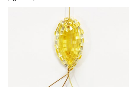
Step 7: The joint is created on the rear side (fig. no. 7)