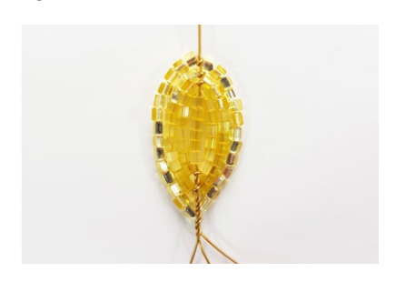
Cut the loop at the base of the petal in half so that you create the secondary axes (fig. no. 8).