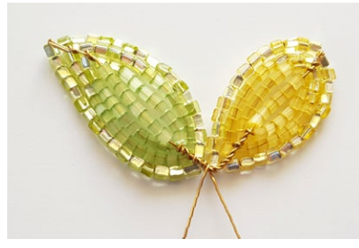
Step 12: Make 2 more parts consisting of 2 petals. The second part consists of a light blue and purple petal and the third part consists of a red and orange petal. The petals are bound in the same way as the yellow petal. Choose the color of the wire according to the color of the petals (fig. no. 15).