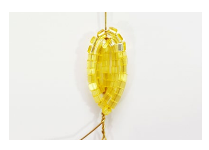
Create the third pair of rows using only TR (fig. no. 6).