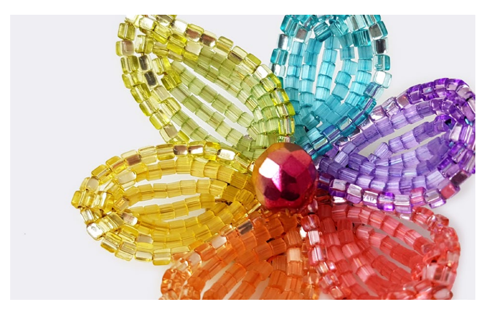
Design by Svetlana Sapegina