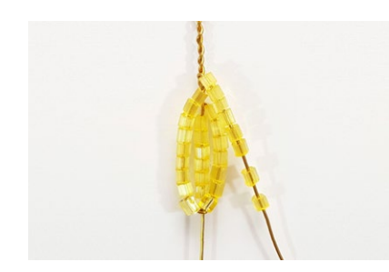
Step 5: Create a second pair of rows. Shape the tops of the rows with three TR to the left and right of the axis wire (fig. no. 5).