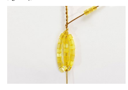
Pull the seed bead from the working wire close to the axis wire and turn the seed beads downwards in order to create the sharp point of the petal (fig. no. 4).