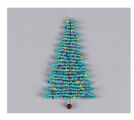
Step 7: Tie the cord, a ribbon or an earring hook to the top hole on the guide.