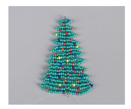
Step 5: If the longest projections are soft, you can thread the line through them one more time. The length of the line should enable this. The line will change sides (from the left to the right and vice versa). At the end, tie off the line with three knots. Pull the end into the R8 and cut it off.