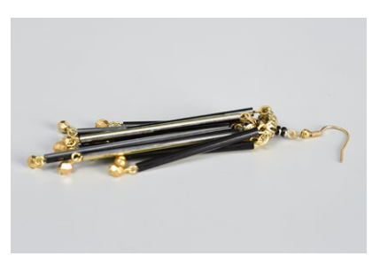
Step 11: Create the second earring