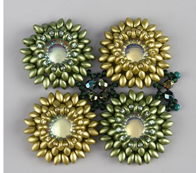
Step 7: Sew the edges of the circles on both sides of the bracelet. String 5 R_3 between each circle. Sew through the outer T. Sew through the T located next to each other with their points together (4x). Sew 1 R_3 (3x) into the gaps between the T with the ends pointing away. Add 1 R_3 between the T in the circles by the arm. String 2 R_3 and 1 R_3 behind the T. Thread the line through all of the strung R_3 and the threaded T one more time. Tie off the end of the line and pull the knot