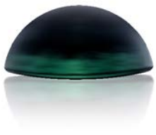
40100 (147056) smoke grey