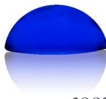
30030 (157001) sapphire