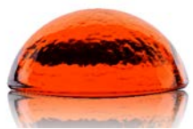
10040 golden topaz