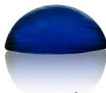
60030 (157003) aquamarine