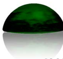
50030 (157010) olivine