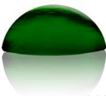
50030 (157011) olivine