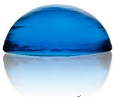
60010 (157004) aquamarine