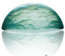
60110 (157006) aquamarine