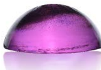
70550 (147084) rubinite