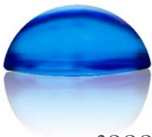
30000 (157002) sapphire