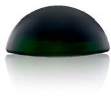
50030 (147054) olivine