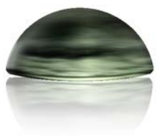
40100 (147060) smoke grey