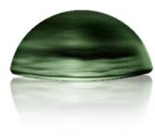
40100 (147058) smoke grey