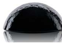
40100 smoke grey