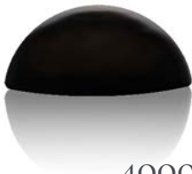
40000 (157007) smoke grey