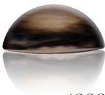
40000 (157009) smoke grey