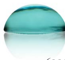
60000 (157005) aquamarine