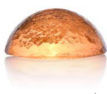
70720 (147070, 147072) apricot