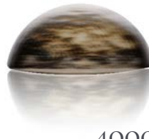
40000 (157008) smoke grey