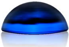
60030 (147044) aquamarine