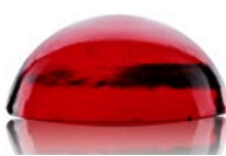
90031 ruby topaz