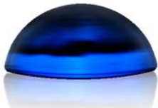
60030 (147044) aquamarine