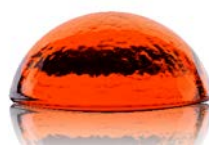
10040 golden topaz