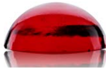
90031 ruby topaz