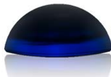
60350 (147052) siamese sapphire