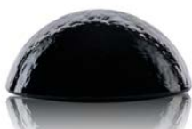
40100 smoke grey