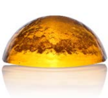
10030 (147068) golden topaz