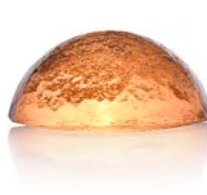
70720 (147070, 147072) apricot