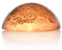
70723 (147026, 147028) apricot