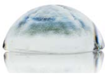
00031 crystal | non-standard