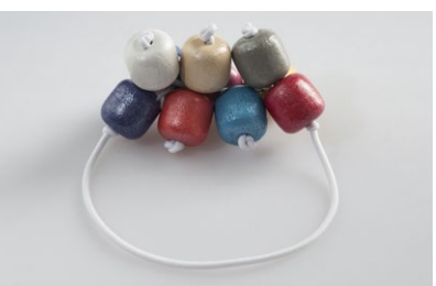
Double elastic Step 6: Cut off about 120 cm of elastic. Thread it through the thread loop. Fold the elastic in half. Then continue in the same way as with the single elastic.