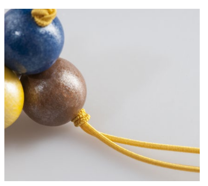
Step 7: The same as with the single elastic.